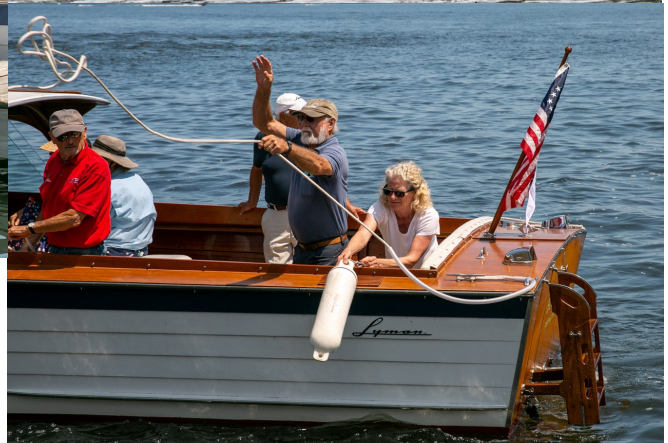
Various Rendezvous around Lake Champlain