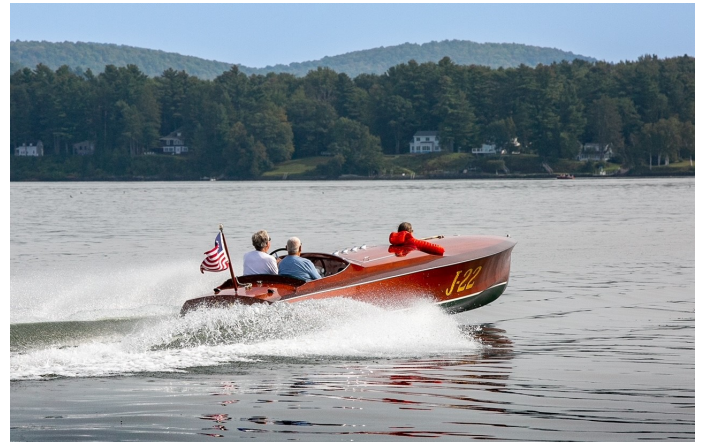
Smooth waters in September on Lake Memphremagog. See more on page 3