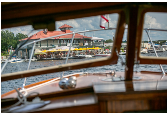
A view of Splash during the 2023 Boatshow.